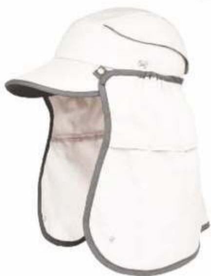
Sun Guide Cap