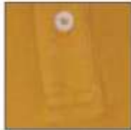
Unique Bold Loop Stitching at End of Placket