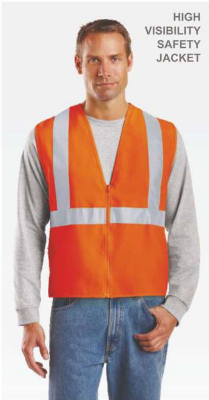
HIGH VISIBILITY SAFETY JACKET